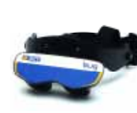
BUG (BCF UNIVERSAL GOGGLES)